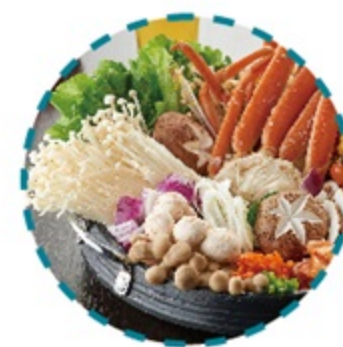
火锅食材及用品 HOT POT INGREDIENTS AND SUPPLIES