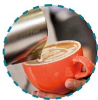
烘焙轻餐、咖啡茶饮 BAKERY & LIGHT FOOD, COFFEE & TEA