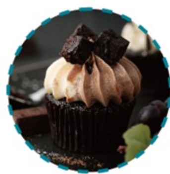
休闲食品、甜食、巧克力 SWEETS & SNACKS