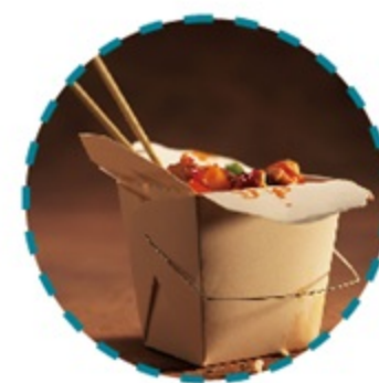
外卖产业链及包装 DELIVERY & TAKEAWAY INDUSTRY CHAIN & PACKAGING