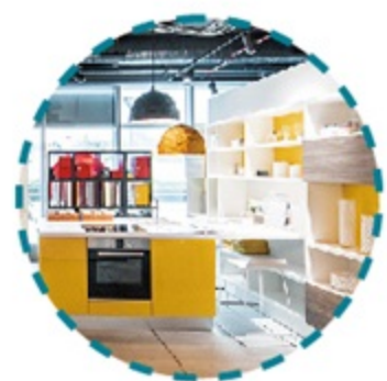
餐饮及智能店装设计 CATERING & INTELLIGENT STORE DESIGN