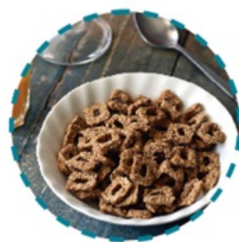
婴童食品 KIDS FOOD