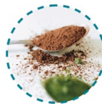
调味品及油品 CONDIMENTS & OIL