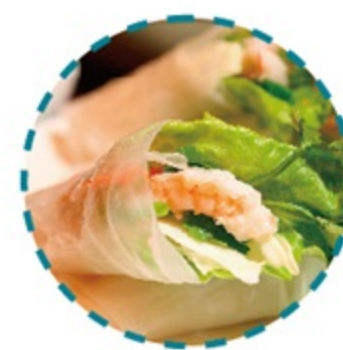
高端食材供应链 HIGH-END INGREDIENTS SUPPLY CHAIN